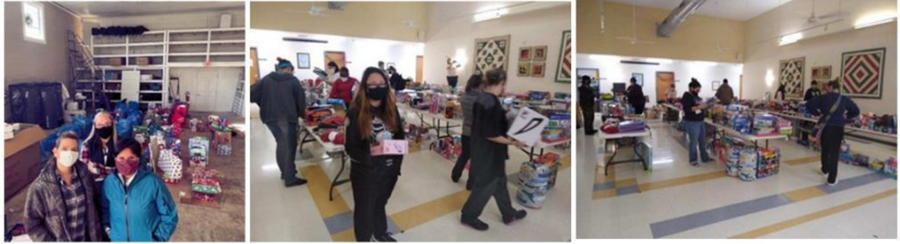
St. Nicholas Pictures: Delivery of St. Nicholas Gifts

In addition, forty children from Families Together and 233 children from CommWell Health each received a $50 gift certificate from either Walmart or Amazon. The gift-card drive was such a success that there was enough money left to also provide each family served by CommWell Health an additional $25 gift certificate.