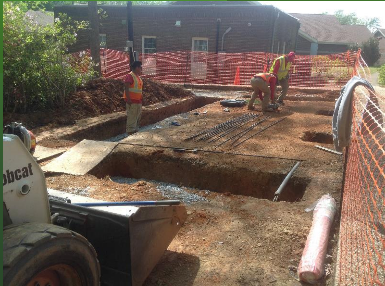
Columbarium Construction - 2014