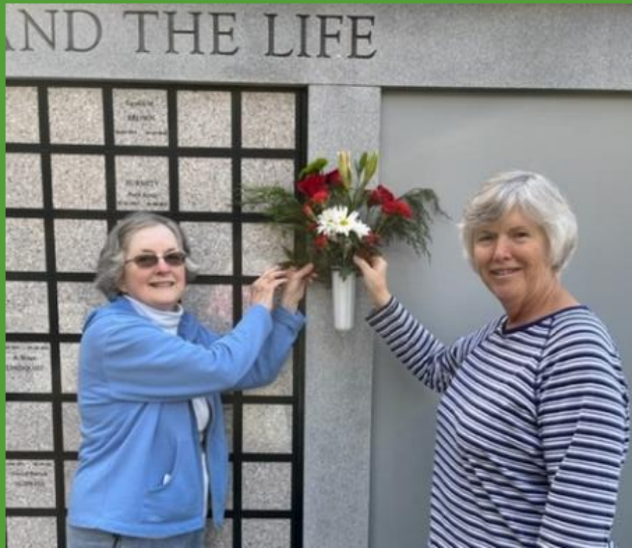
Memorial Garden Flower Team