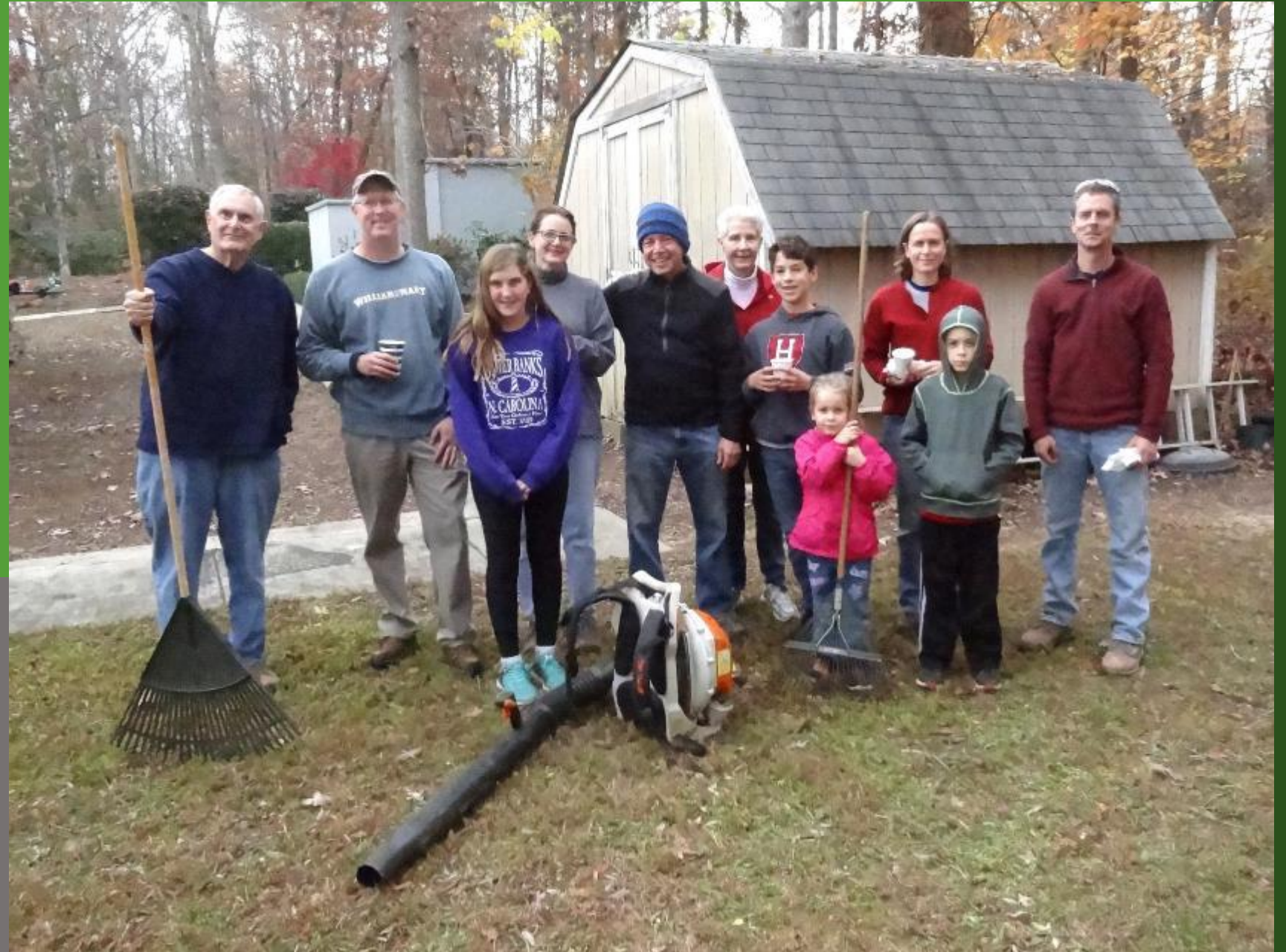
Memorial Garden Workdays