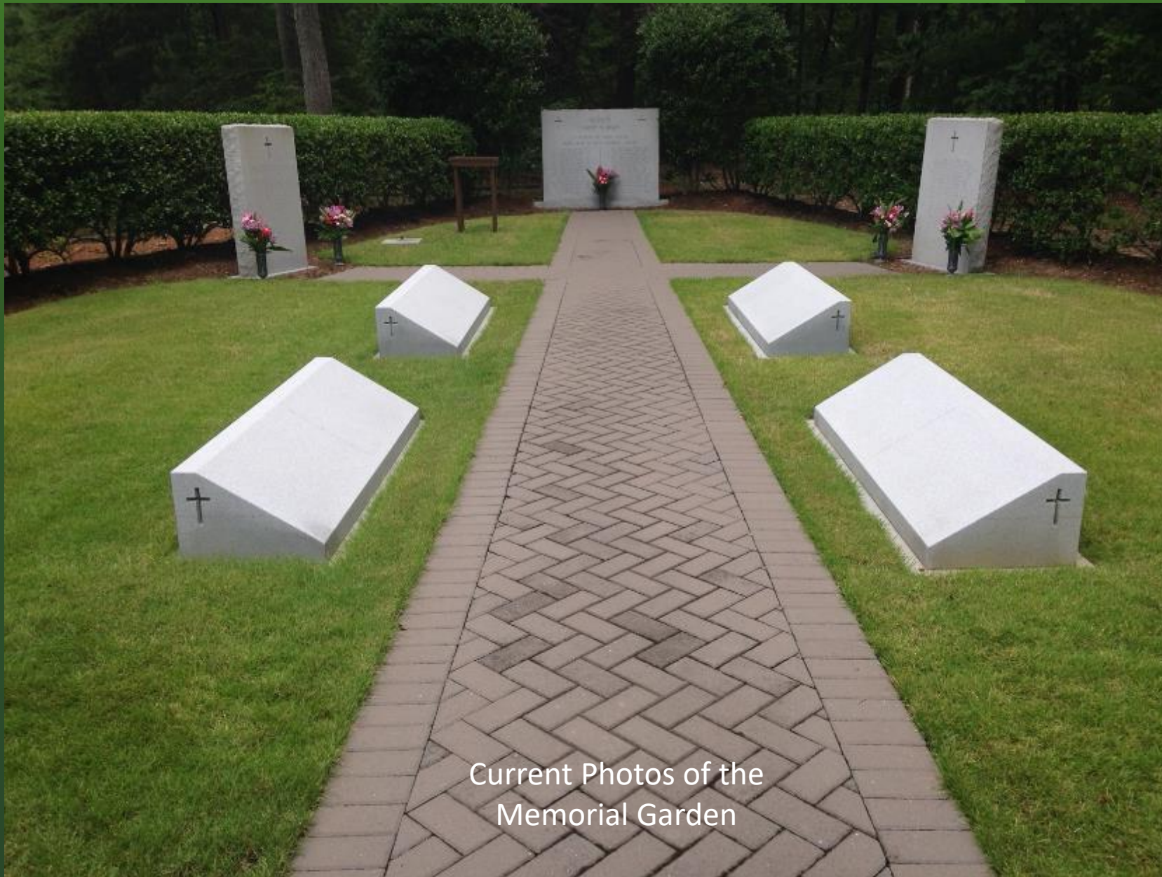
Current Photos of the Memorial Garden