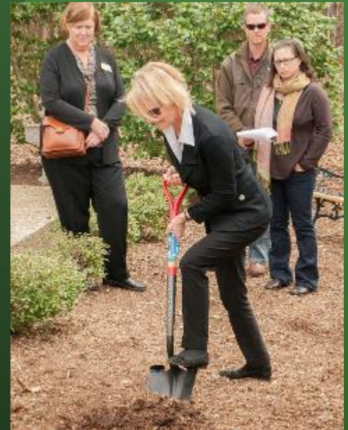
Columbarium Groundbreaking - 2014