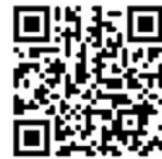
St. Paul's Website

Please visit our website for more information about our community: