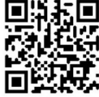
St. Paul's Website

If you have a name you would like to include on the prayer list, or a ministry event that you would like to announce in this printed bulletin, please send information to announcements@stpaulscary.org . Please note that there is a 2-week lead time on printed announcements.