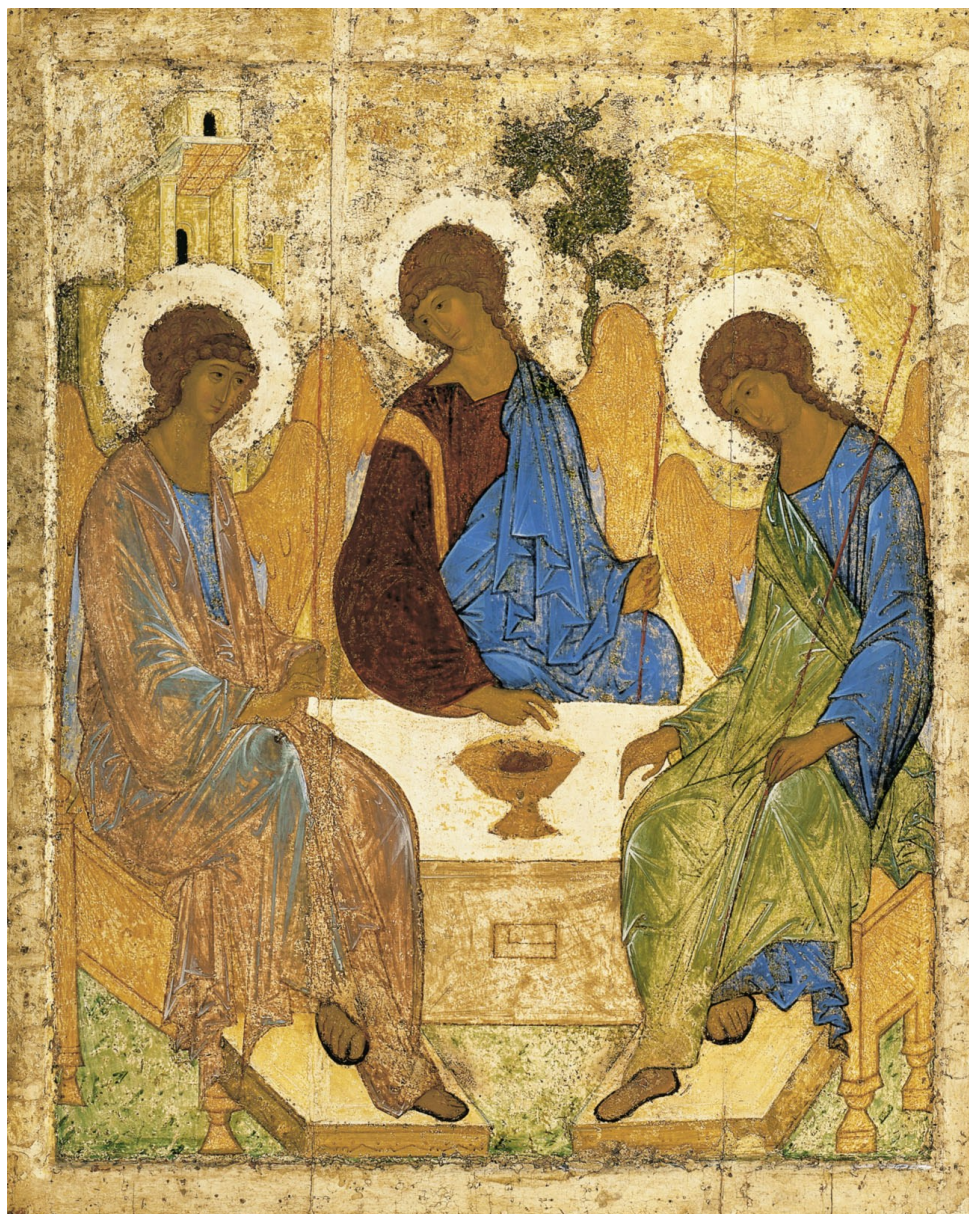
Andrei Rublev, icon most frequently referred to as The Trinity, 1425.

If you have a name you would like to include on the prayer list, or a ministry event that you would like to announce in this printed bulletin, please send information to announcements@stpaulscary.org . Names included in the prayer list will remain for a month, and we are happy to extend at your request. Please note that there is a 2-week lead time on printed announcements.