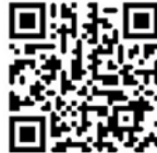
St. Paul's Website

If you have a name you would like to include on the prayer list, or a ministry event that you would like to announce in this printed bulletin, please send information to announcements@stpaulscary.org . Names included in the prayer list will remain for a month, and we are happy to extend at your request. Please note that there is a 2-week lead time on printed announcements.