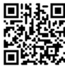
St. Paul’s Website

If you have a name you would like to include on the prayer list, or a ministry event that you would like to announce in this printed bulletin, please send information to announcements@stpaulscary.org . Names included in the prayer list will remain for a month, and we are happy to extend at your request. Please note that there is a 2-week lead time on printed announcements.